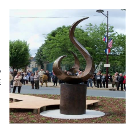
FLAME OF FRIENDSHIP