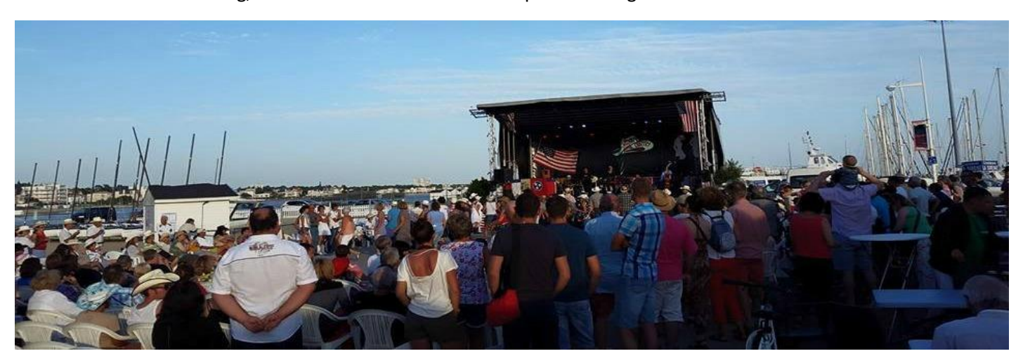
(A really lovely venue on the ROYAN beach with sailboats all around. This photo does not really do justice to the amount of people there...a huge and lovely crowd, particularly after the sun went down.)